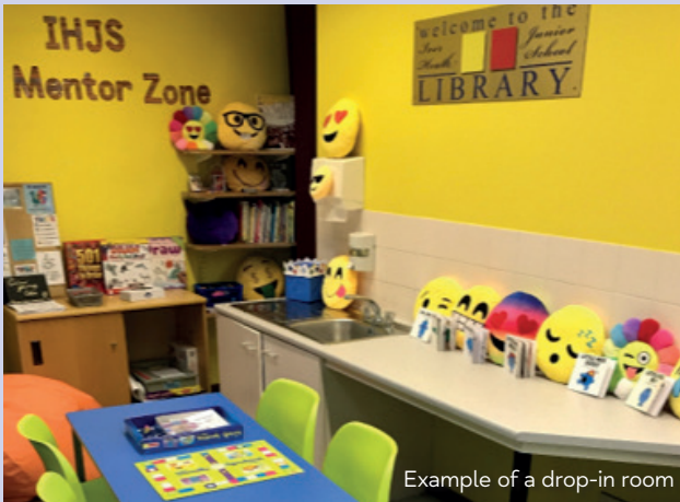
Example of a drop-in room